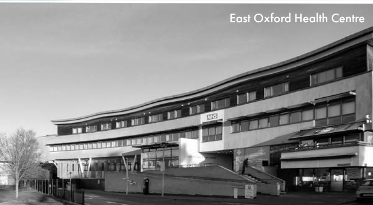
East Oxford Health Centre