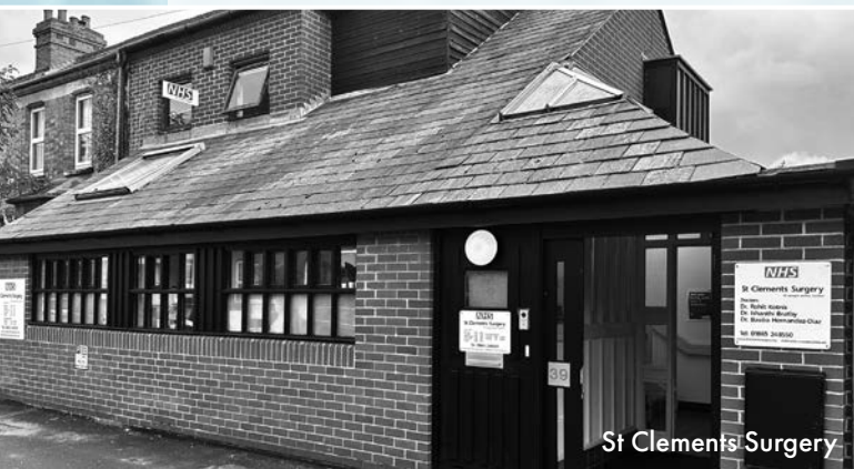
St Clements Surgery