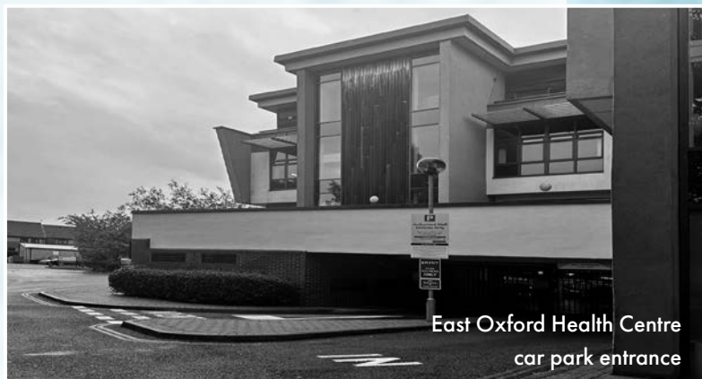
East Oxford Health Centre car park entrance