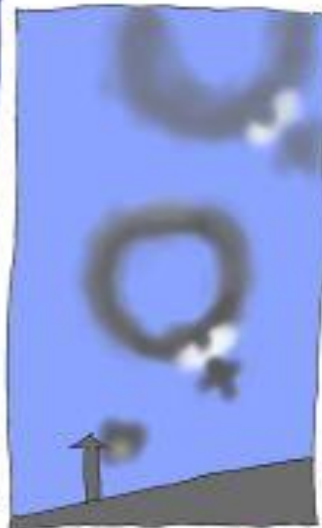
No women priests