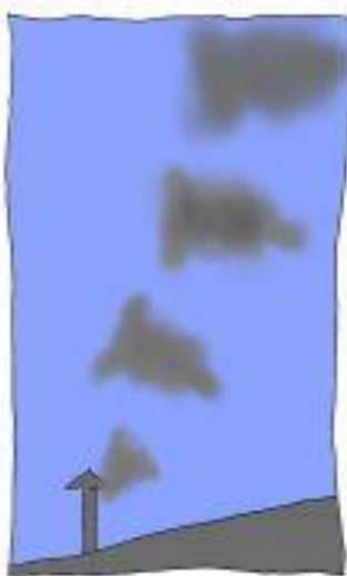
No new policy on contraception