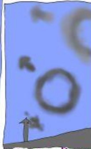
No new policy on celibacy