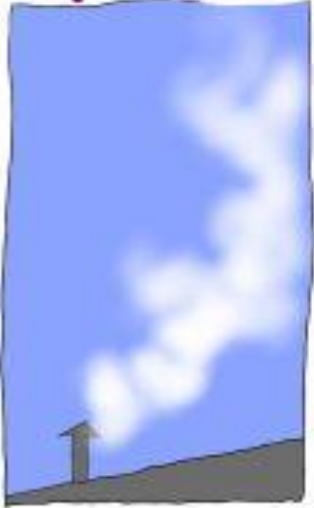
A new Pope