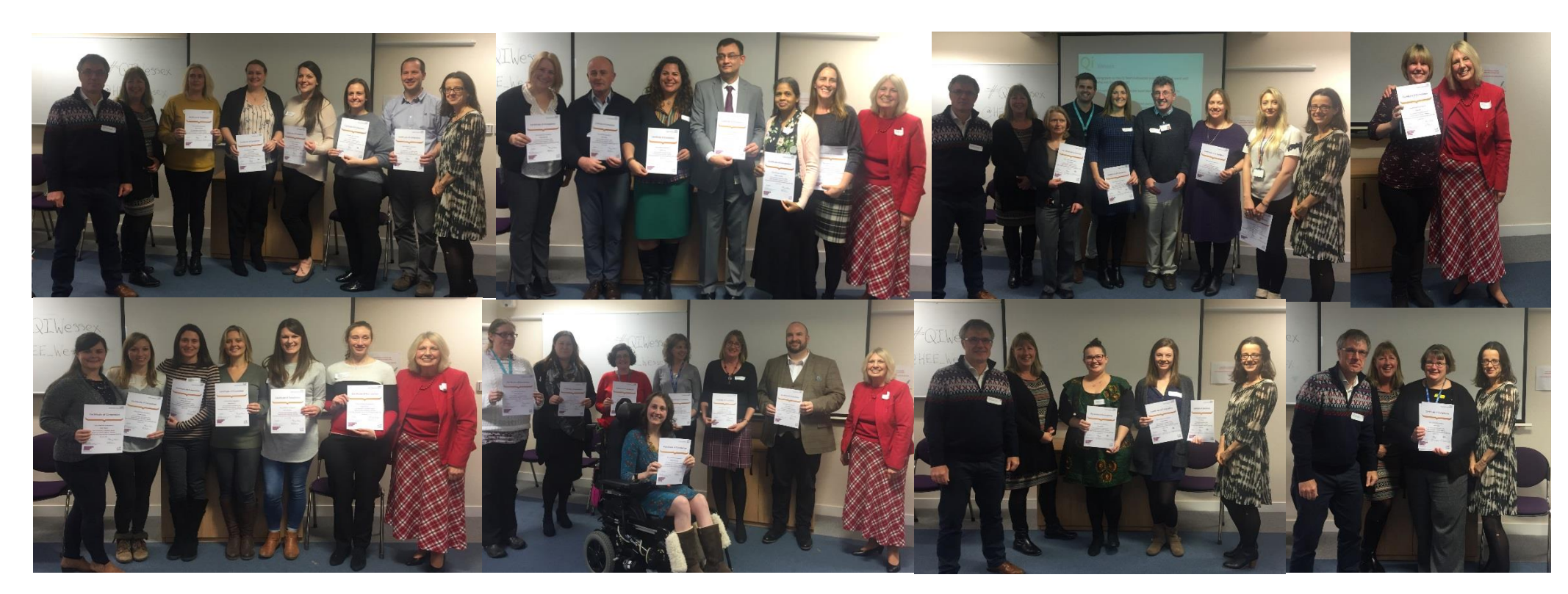
The eight Teams who successfully completed this Fellowship programme with their education providers

Some sound bites and photos from the day can be found on Twitter #QIWessex.