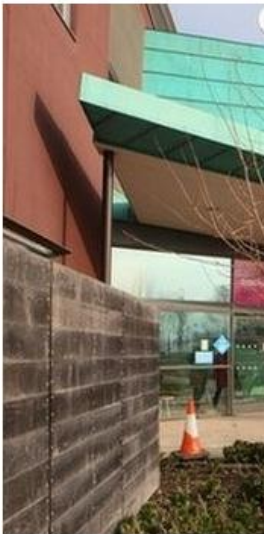
The Gloucestershire Royal Hospital is one of the hospitals that has declared a major incident. Major incidents remain at hospitals across England as staff